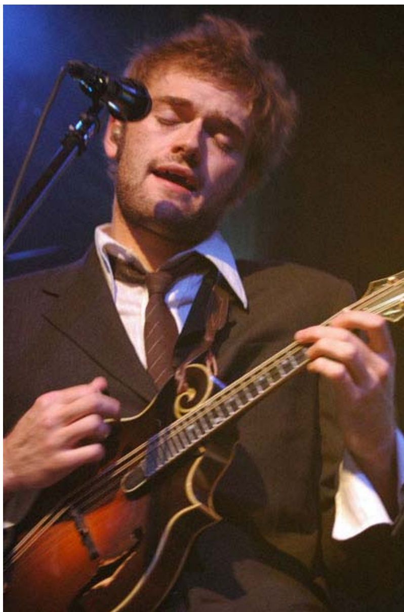
Nickel Creek's Chris Thile