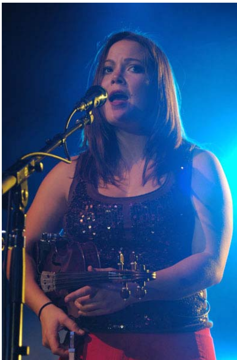
Nickel Creek's Sara Watkins

As the show progressed, Thile presented "Stumptown," a song conceived while on lots of coffee. Here's to consuming caffeine! "Scotch & Chocolate" closed the night proving that the energy of this band goes all the way to the end.